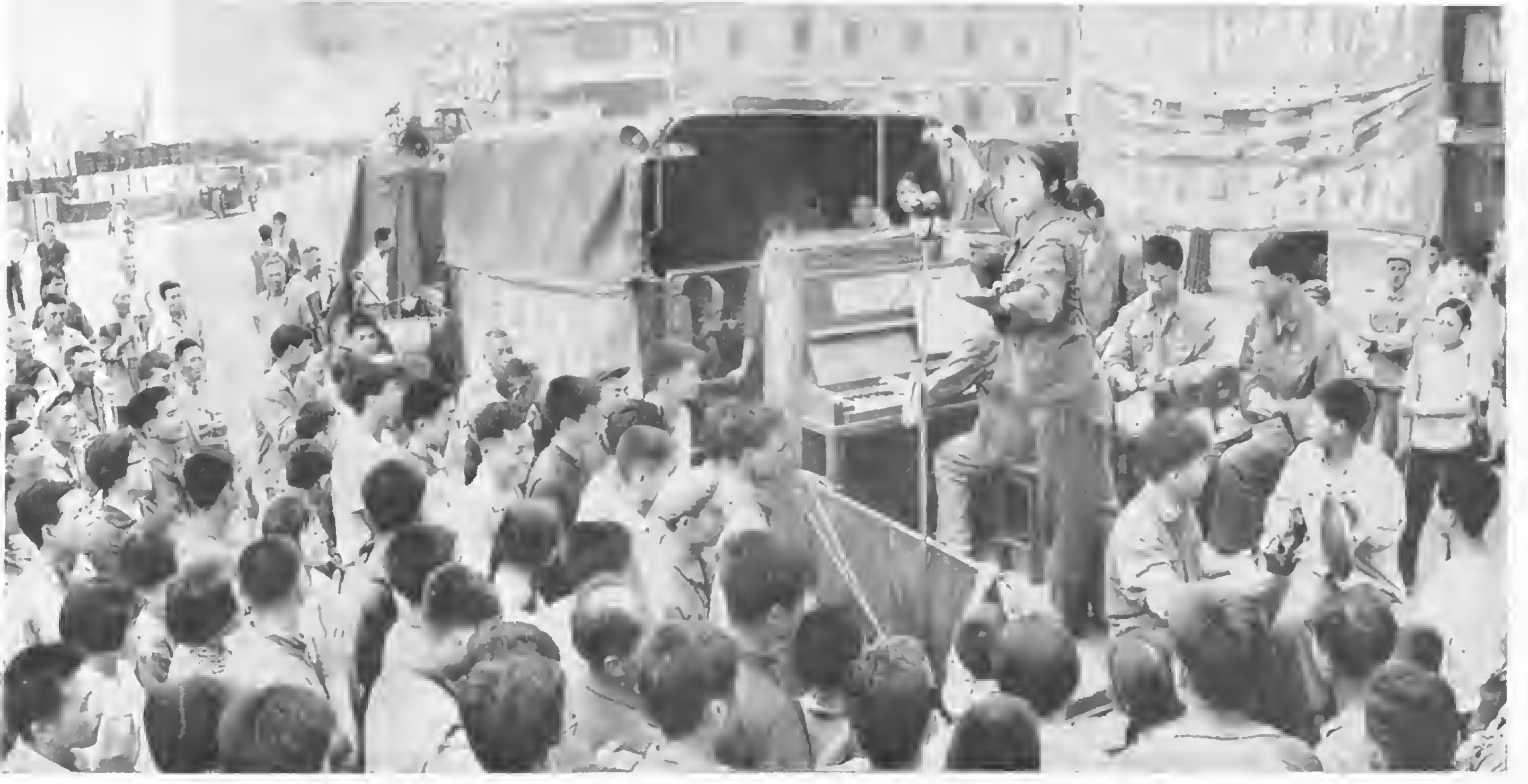
Revolutionaries of the Shanghai Conservatory of Music bring The Red Lantern with piano and songs to dock workers.